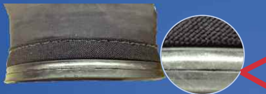
Generation 1 Wrist ZipRing

This ring is smooth and has no seam in the center.