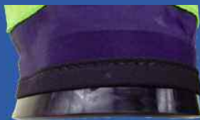
Generation 2 Wrist ZipRing

This ring is smooth and has no seam in the center.