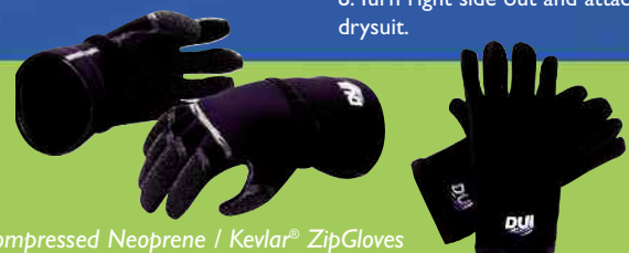
Compressed Neoprene / Kevlar® ZipGloves with fleece liners