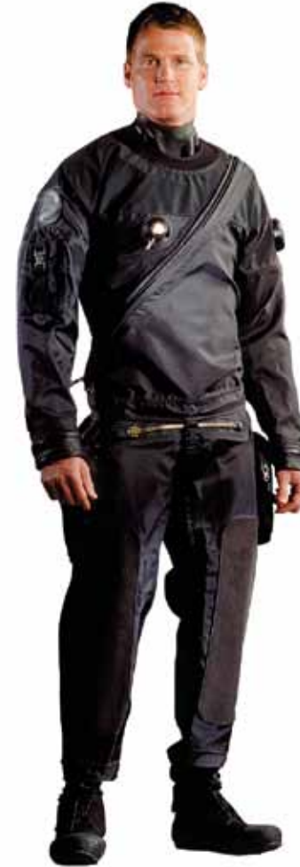
US NAVY SEAL TLS