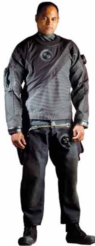
US ARMY COMBAT DIVER CLX