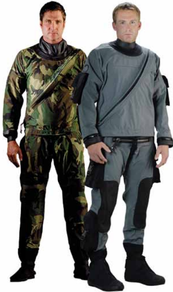
AIR AMPHIBIOUS OPERATIONS DRYSUITS