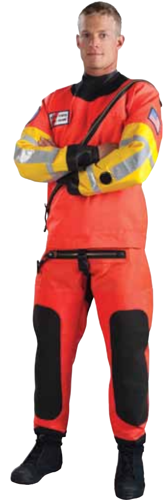
US COAST GUARD RESCUE SWIMMER TLS